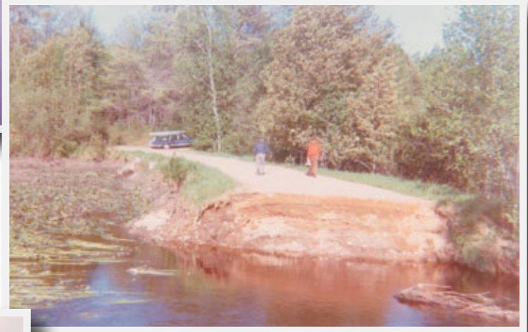
◀ Water level on Upper Lake at the time of the washout on Dam Road (summer 1970).