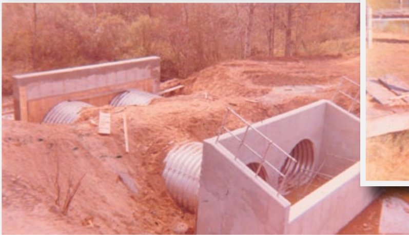
◀ Our current dam under construction.