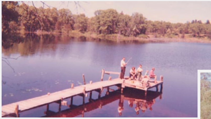
◀ The Demro dock and water levels in the summer of 1969.